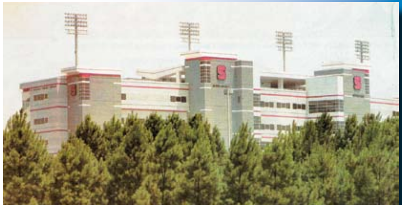
CARTER-FINLEY STADIUM VAUGHN TOWERS